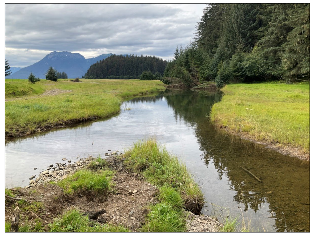
Figure 2.—Confluence of stream and river-left tributary at waypoint 1454.