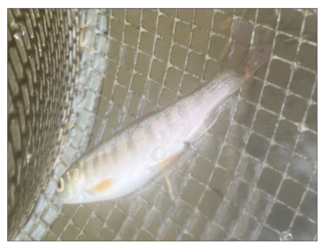
Figure 1.-Juvenile coho salmon captured at waypoint 1455.