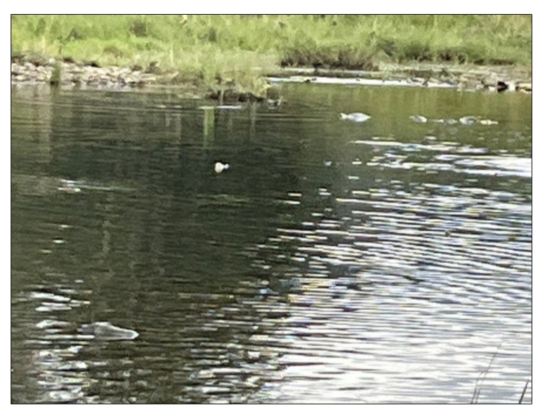
Figure 3.-Adult pink salmon observed near the confluence at waypoint 1454.